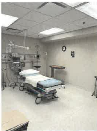
ER Room #3