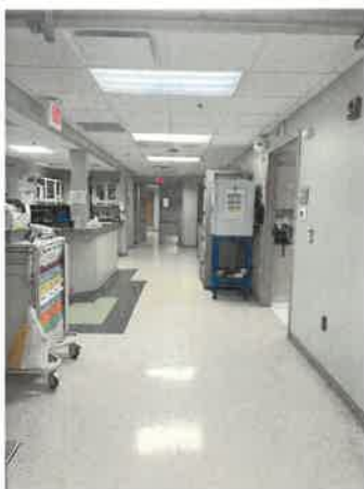
Entering from ambulance bay