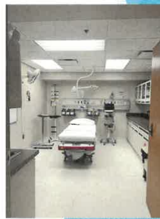
ER Room #2