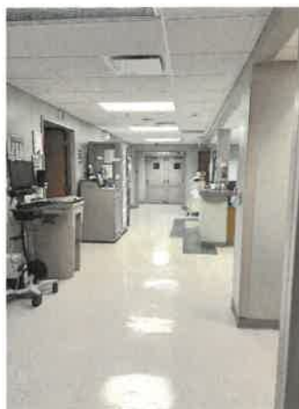
Entering ED from floor